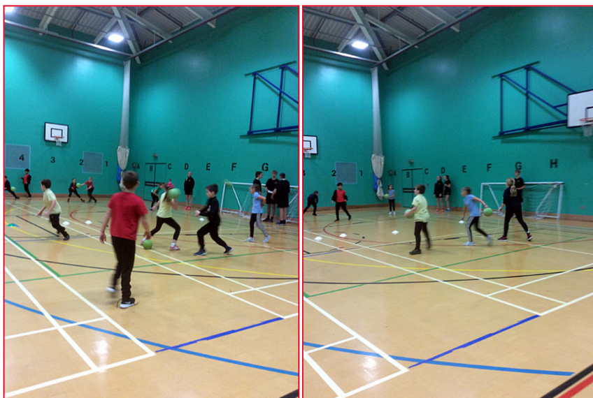
Year 5 pupils learn dodgeball at Abbey Park School

We're now looking forward to reviewing the first year's work at an end of year joint staff meeting and planning for the next steps in 2019/2020.