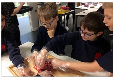
Year 6 pupils investigate the circulatory system in a specialist-taught science lesson at Abbey Park