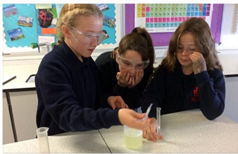
Year 6 pupils investigate the effect of acid rain on rocks in a science lesson at Abbey Park

A Year 9 to Year 6 mentoring scheme is being devised. Work undertaken at Red Oaks to develop fluency, reasoning and problem solving has helped shape the decision to adopt the ARK Maths Mastery scheme at KS3 in both Trust secondary schools.